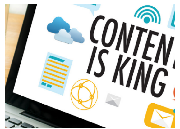
Are You Overlooking a Lucrative Source of Well-Paying Freelance Gigs?