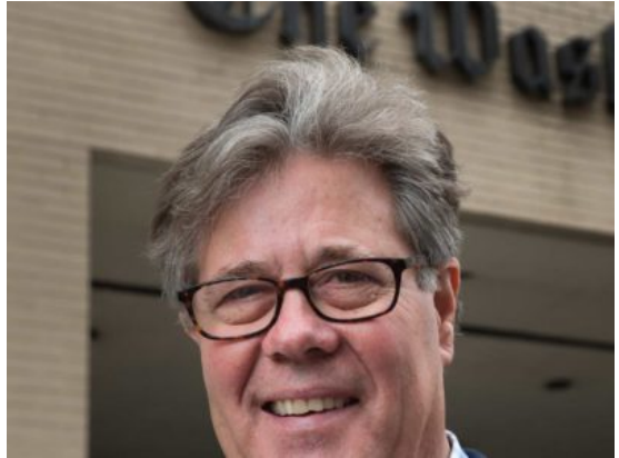
He's Written About the White House and His Own House