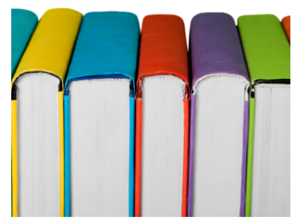
The Secret Life of a Would-Be Novelist